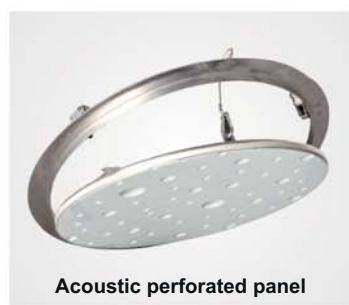
Acoustic perforated panel