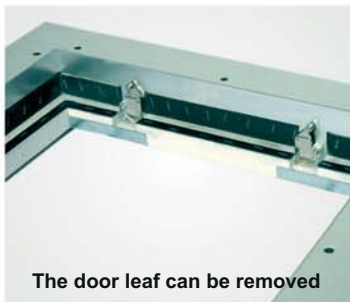
The door leaf can be removed

Product description: The access panel is made of aluminium profiles with 40 mm (I90) plasterboard inlay (GKF). The two frames of the access panel each consist of four individual frame parts that are firmly joined together by a special welding process. The fire protection doubling on the back achieves the required fire protection. The access panel is equipped with two safety catches. To avoid possible accidents, these must be re-hung after each opening of the door leaf. There is an air gap of 1.5 mm between the frame and