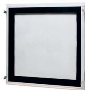
tested up to 600 x 600 mm

Now also available in 'air- and dust-tight design' and in stainless steel!